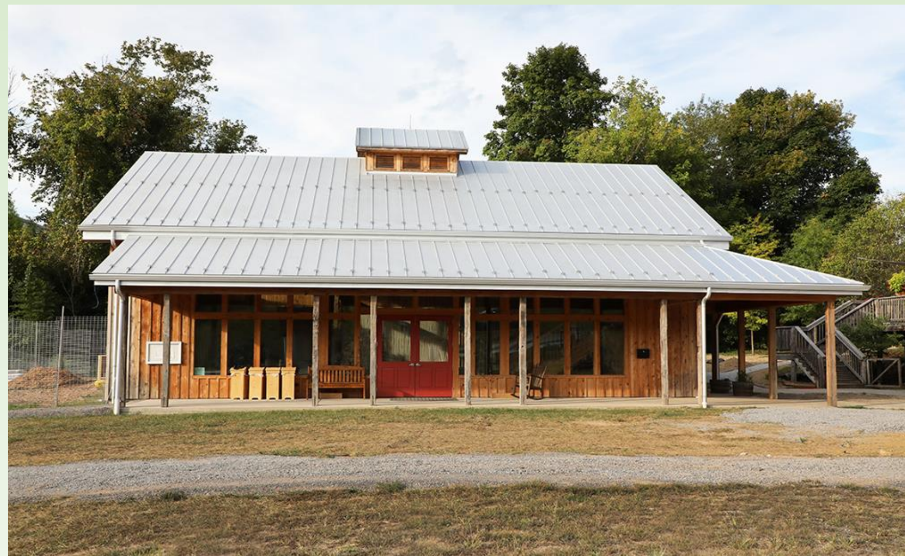
Clingman Center offers a teaching kitchen, demonstration gardens, food access markets, walking trails, and community-led initiatives.

Collaborating with an expanding partner group, WVSOM has invested in the Clingman Center for Community Engagement and is establishing a complex service system to meet local priorities.